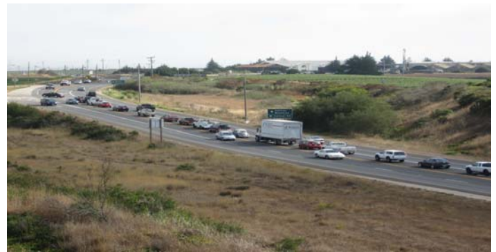
Existing Highway 1 / Salinas Road Intersection