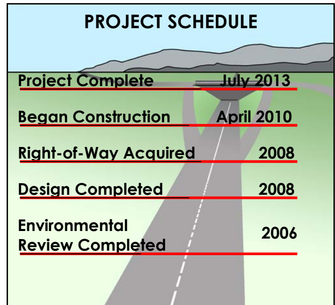
Estimated schedule - subject to revision